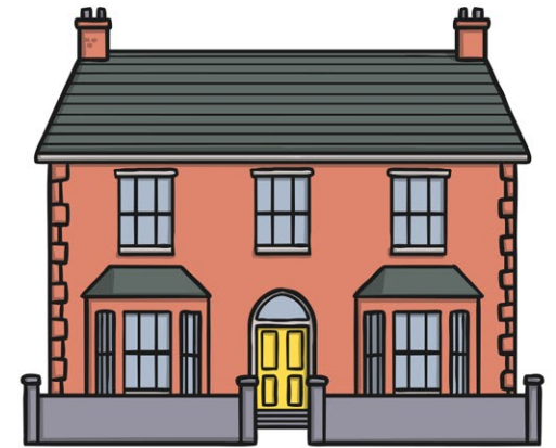
house with your own bedroom