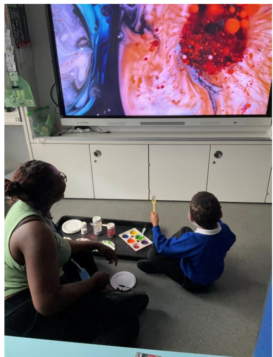
Some of our work from Children in Need and from Diwali.